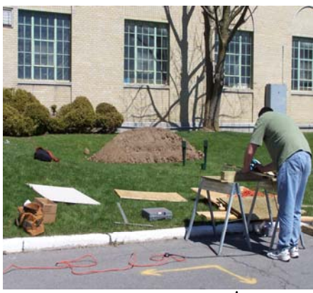
some pressure-treated lumber, boxes of mosaic tile...