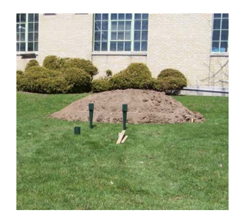
What happens when you take a mound of dirt...