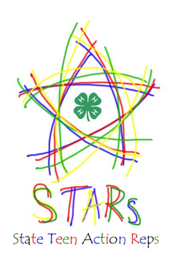
This project is a testament to the creativity, energy and ability of youth to make great things happen in their club, community, country and world when given the opportunities and supports to do so.