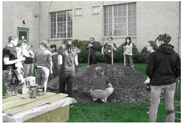
You've got the resources to make a YOUTH ACTION PROJECT conceived at STARR 2007, a reality during STARR 2008!